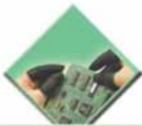
CONTROLLED ENVIRONMENT PRODUCTS