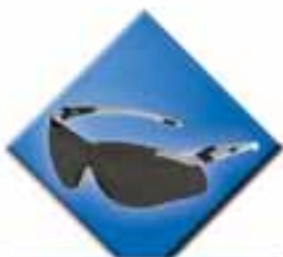
EYE & FACE PROTECTION

North has taken the lead in this market by offering niche products such as the highly specialized Silver Shield line, along with Viton, Butyl, Nitrile, Neoprene, Rubber, Kevlar, etc. Included in this catalogue is a complete line of disposable gloves, liquid proof, cut resistant, cut & sewn nitrile gloves, winter lined gloves, as well as long sleeve gloves for general and sand blasting purposes.