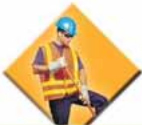
TRAFFIC SAFETY PRODUCTS