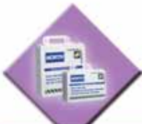
FIRST AID PRODUCTS