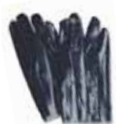
T450 - T455