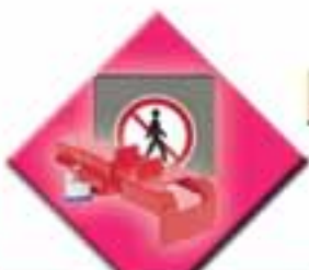
SIGNS AND LOCKOUTS