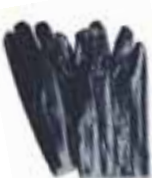
TP450 - TP455