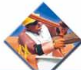
ELECTRICAL SAFETY PRODUCTS